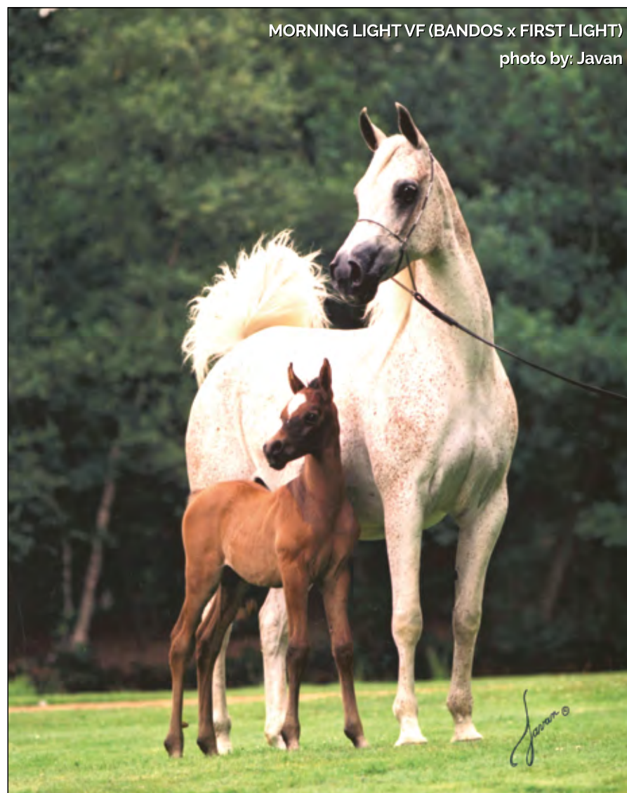
MORNING LIGHT VF (BANDOS x FIRST LIGHT)

Among the early foundation mares were individuals whose names continue to resonate profoundly within the legacy of Jadem Arabians - mares whose influence is evident in the vast majority of the horses currently at the stud as well as other prominent breeding programmes around the world. Their unwavering capacity to produce progeny of exceptional quality has secured their continuing