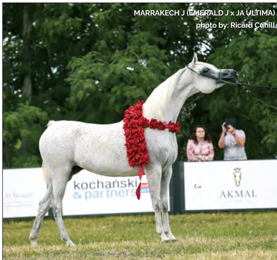
MARRAKECH J (EMERALD J x JA ULTIMA)

When reflecting on the foundational mares of Jadem Arabians, one cannot overlook the exceptional Elegantkah (Gwizd - Eminencja by Algomej). Foaled in 1994 and tracing back to the esteemed Wotoszka dam line, this