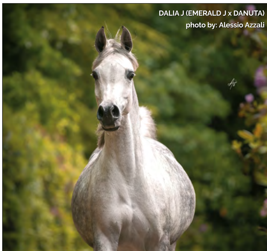
DALIA J (EMERALD J x DANUTA)

Champion Junior Filly. In 2015, Dalia J made her mark by securing the title of Silver Champion Junior Filly in Deauville, followed by a sweep of top honors as Gold Champion Junior Filly and Best in Show at the Arabian Horse Weekend. The most decorated among them, Dana J, has amassed an impressive list of accolades, including Silver Champion Junior Filly in Ströhen (2018), Gold Champion Yearling Filly at the Al Khalediah European Arabian Horse Festival (2018), Gold Champion Yearling Filly and Best in Show at the 2018 Arabian Horse Weekend, and Bronze Champion Junior Filly at the 2020 European Championships in Prague. Continuing her success in the senior division, Dana J was named Belgian National Bronze Champion Mare in 2023.